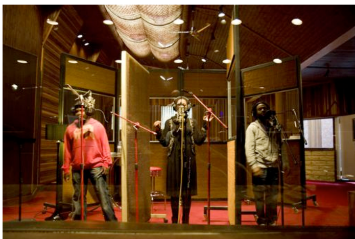
Valete (PT), Mariama (DE), GMB (NL)

European festivals and capitals from Sweden to Spain during the year 2011. A travelling graphic art exhibition presenting different interpretations of graffiti and street/urban art will follow the festival tour and album release. Last but not least, a digital platform will be set up as a social network, communication tool and news update site: www.diversidad-experience.com