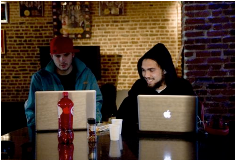
Orelsan (FR) & Marcus Price (SE)