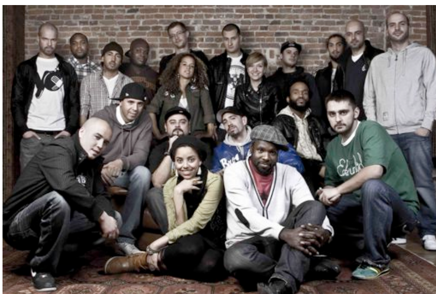
The 20 artists of the Diversidad album